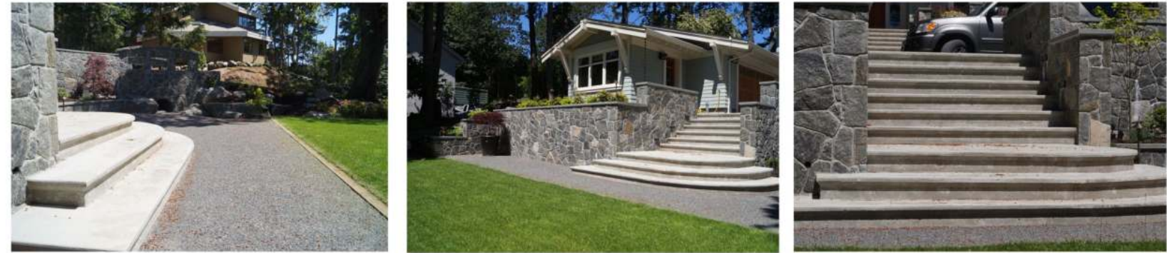
1 Front Stair Pictures - As Built