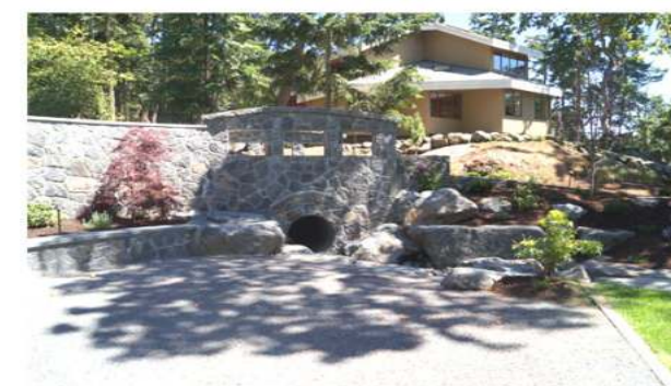
3 The Bridge pictures - As Built